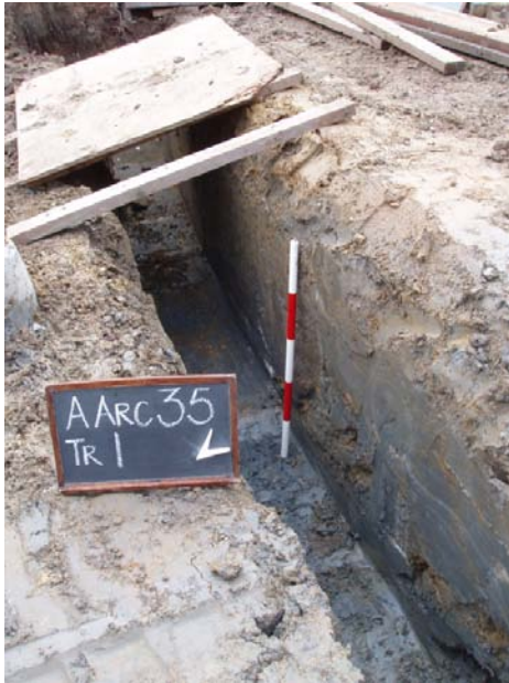
1. SE View of Service Trench 1 Scale x 1 500mm