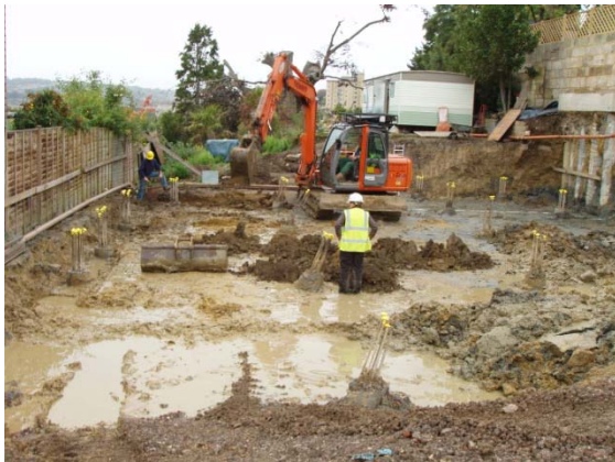
3. General View of the Site