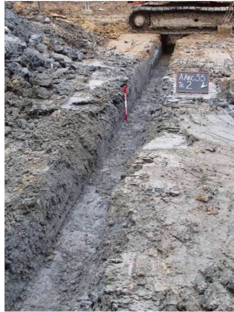
2. SE View of Service Trench 2 Scale x 1 500mm