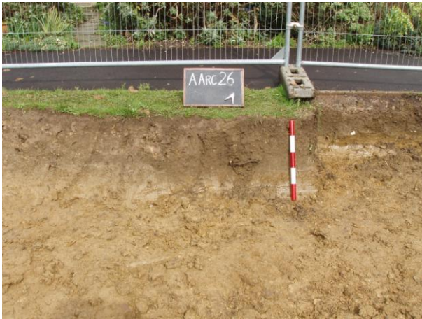
1) SSE Facing Section (500mm Scale)