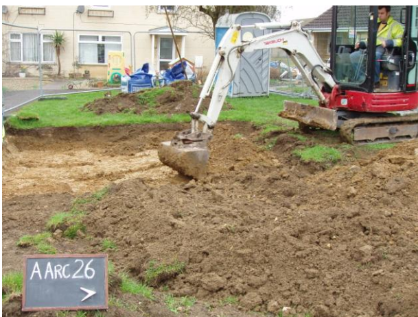
3) General WNW View