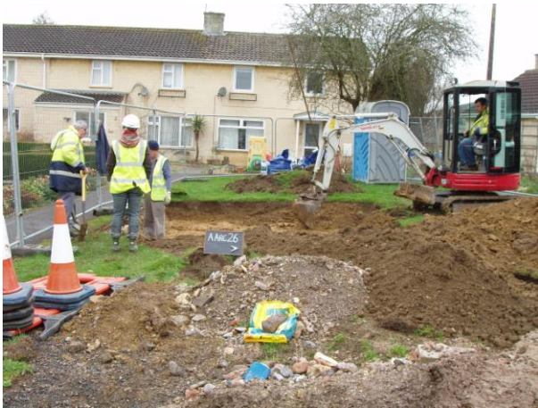
2) General WNW View