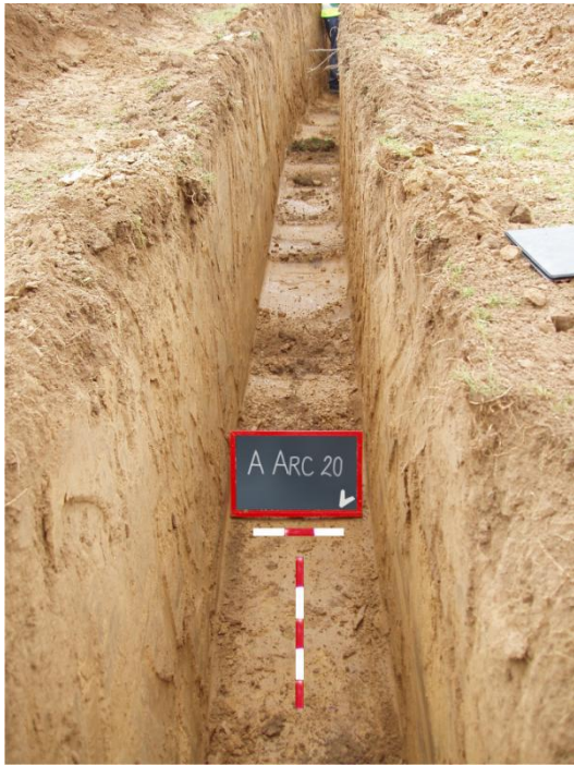
Photograph 3: SEbS view of service trench with X1 300mm scale and x1 500mm scale