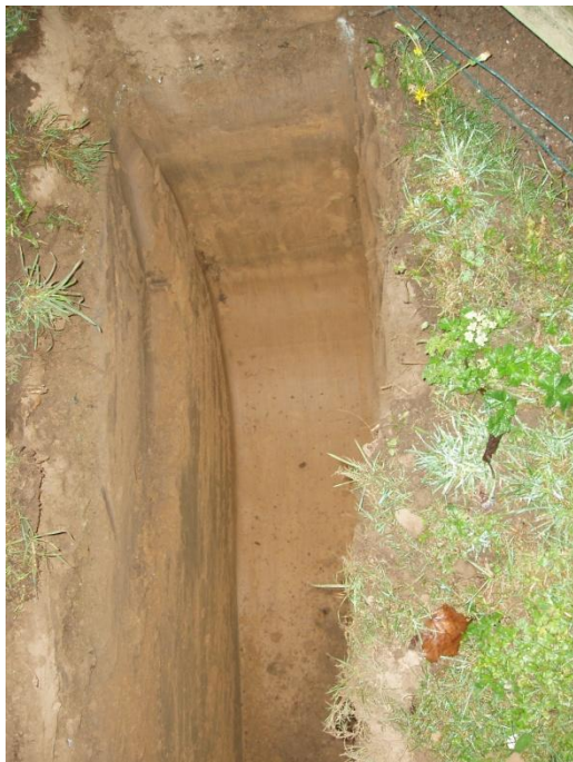
Photograph 4: NbW view showing dark bands of buried topsoil