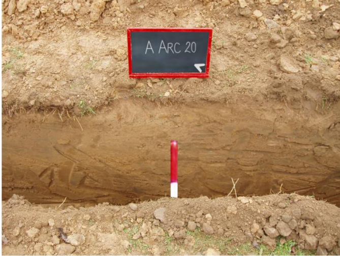
Photograph 1: WSW Facing Section with 1m Scale