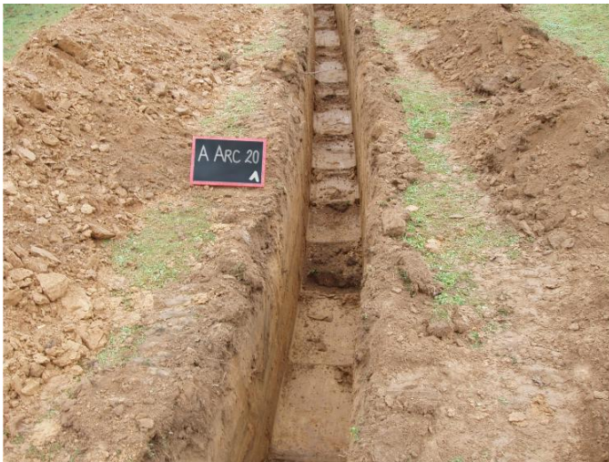
Photograph 2: NbW View of service trench